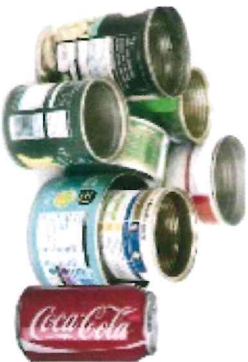
Metal Cans & Containers