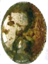
Food / Soiled Containers