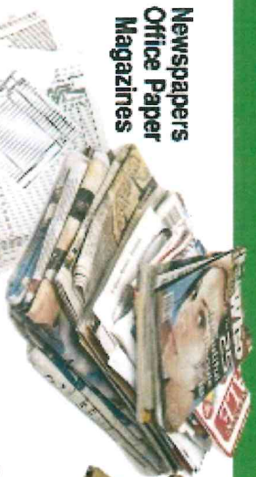
Newspapers Office Paper Magazines