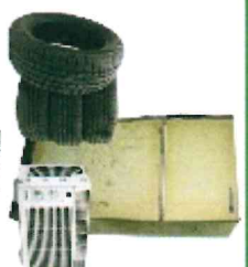
Tires CFC Appliances