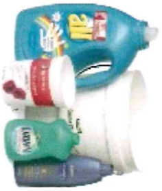
Plastic Containers #1-7