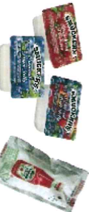
Condiment Packages / Food Wrappers