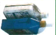
Used Motor Oil Antifreeze