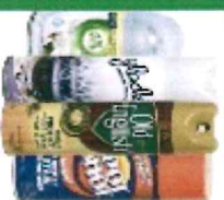
Household Hazardous Waste