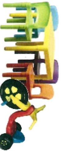
Large Plastic Items / Toys