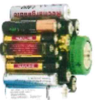
Small Consumer Batteries