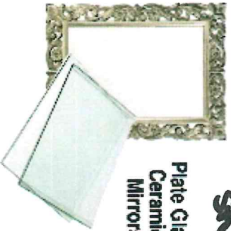
Plate Glass Ceramics Mirrors