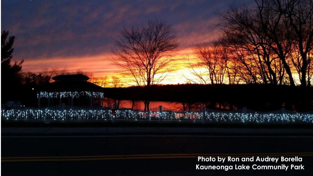
Kauneonga Lake Community Park